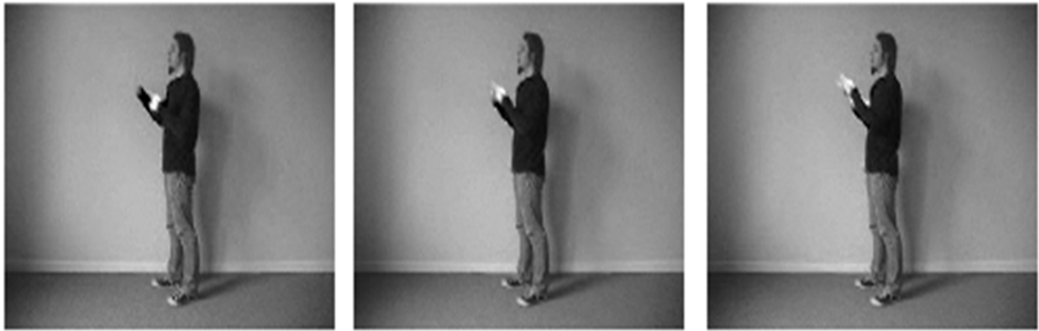
Figure 2 – The example of inter-frame changes accentuation

Analysis of the research results shows opportunities of inter-frame changes amplification. The example of accentuation associated with a movement of the hands is in Figure 2.