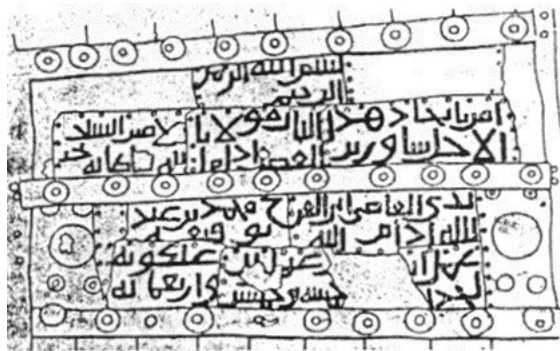
Picture 2 - A schematic description of the inscription