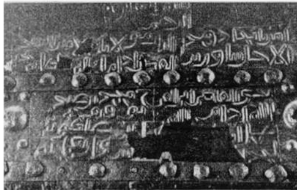
Picture 1 - The inscription on the surface of one half of the Ganja Gate, which is kept in the Monastery of Gelaty near Kutaisi, the Republic of Georgia