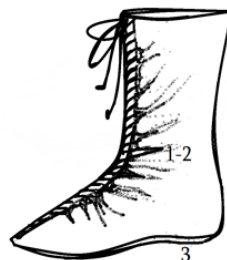
Fig. 3. The sketch of “khamli”.

written and literature sources. It looked like a boot and was tied by the rope [4, 5].