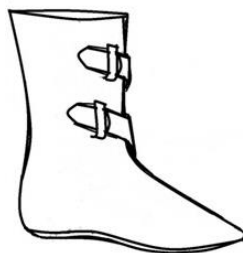
Fig. 4. New kind of “khamli”, with bronze buckles.

4. V-VI – A.D. – “khamli” sewed with a new manner with bronze buckles (fig. 4) [6, 7].