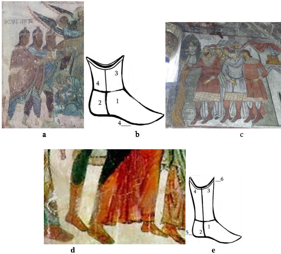
Fig. 5. a) Atenis Sioni VII Century; b) flat ankle-high slipper type “mogvi“ in Matskhvari VIII century; c) Palm Sunday - fragment; d) Atenis Sioni VII century, high “mogvi” boot; e) high “mogvi” boot.

5. In VII-VIII centuries – sandals, flat ankle-high slipper type “mogvi” and high „mogvi” appear [8].