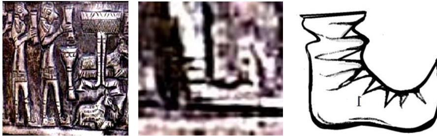
Fig. 1. Fragments from Trialeti bowl. Skatch of the boot with a curling tip.