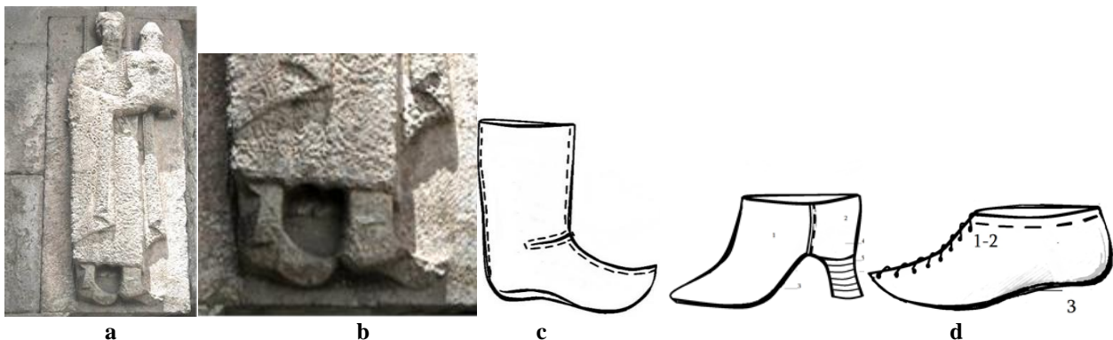
Fig. 6. a) Davit III Kuropalates, Oshki X century; b) high boot - chapla; c) “mogvi” boot, skatch; d) bast shoe.

slippers were intended for lower classes (fig.6) [9, 10].