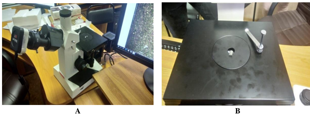
Figure 3 – The equipment for realization of the research: A – general view of the metallographic microscope; B – the microscope stage with the installed casting.

"Moticam" (2 mp). The castings structures were researched at magnification of 400 times. The equipment for realization of the research and the installation scheme of the casting on the microscope stage are presented in the Fig. 3.