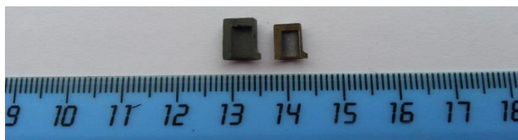
Figure 2 – The castings before heat treatment (left) and after heat treatment (right).

presented in the Fig. 2. The castings were cut into two parts (with a knife and on the electrical-discharge machine) for considering of material structure on the side walls and the bottom.