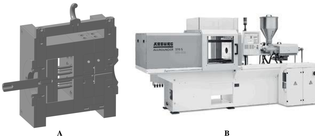
Figure 1 – The mold model for injection molding (A) and the injection molding machine "Arburg Allrounder" (B).

of 3 seconds after the filling process. The molding cycle of the castings lasted from 35 to 60 seconds. The casting process was carried out at cooling liquid temperature of 40 – 60°C. Calculated mass of one casting was 1.1 g. The equipment and the tooling for injection molding are presented in the Fig. 1.